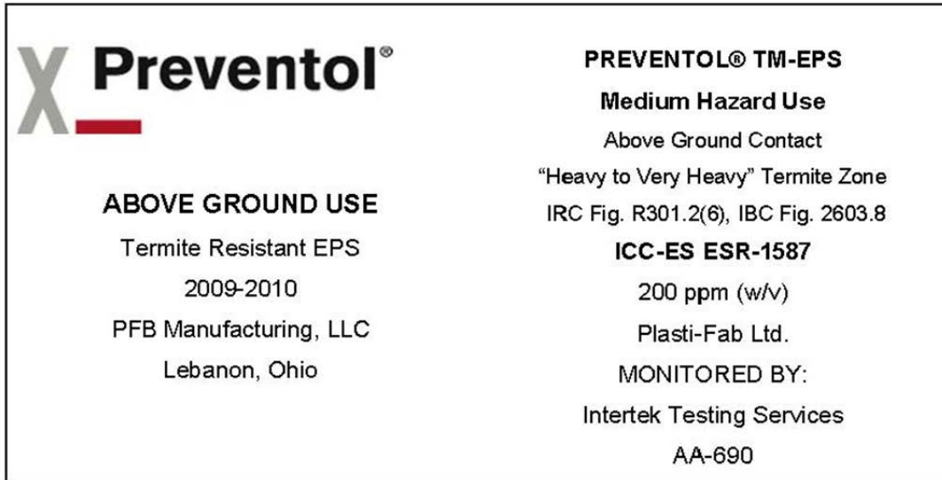
FIGURE 2—PREVENTOL® TM-EPS MEDIUM HAZARD USE MARKING