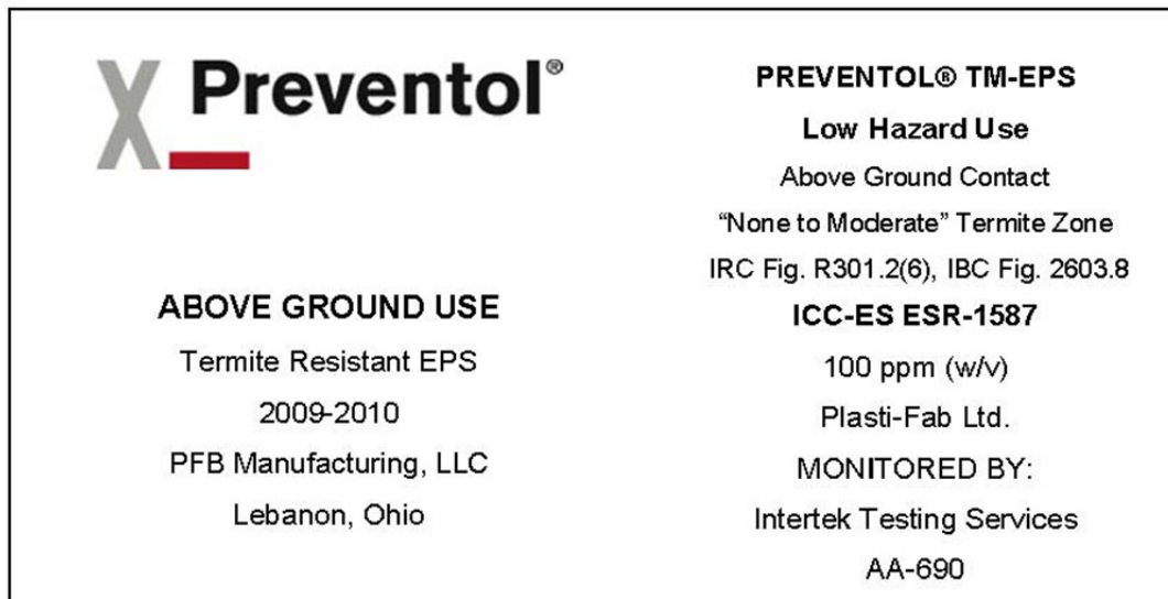
FIGURE 1—PREVENTOL® TM-EPS LOW HAZARD USE MARKING

1 The minimum dosage rate is expressed as ppm (parts per million) and is based on the final volume of molded EPS.